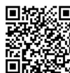
Startup Zone Website

For the latest updates on the Startup Zone, please visit: