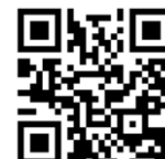
Startup Zones in action