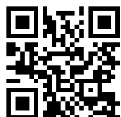
Startup Zones in action